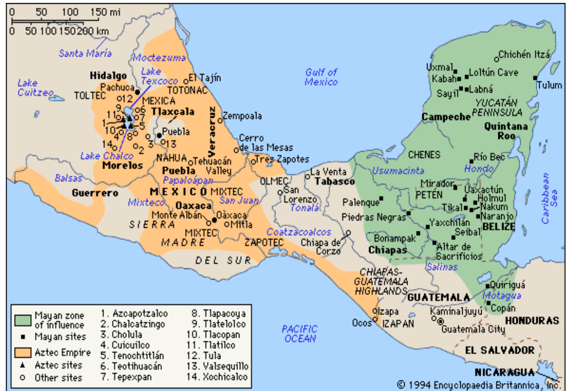
(2002). Olmec Civilization

• They are positioned between the Grijalva and Papaloapa rivers in Southern Mexico